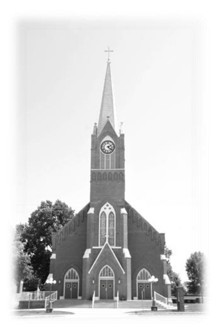
246 Main Street, St. Elizabeth, MO 65075