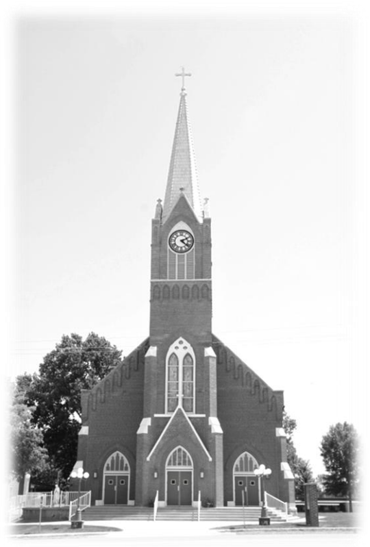
In St. Elizabeth 246 Main Street P.0. Box 128, St. Elizabeth, MO 65075